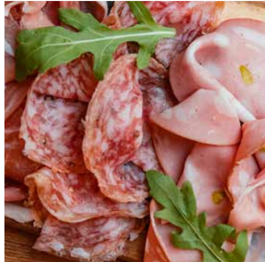
Cold Cuts Platter