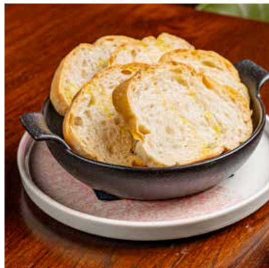
Basket of Bread